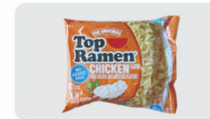
Ramen outer packaging