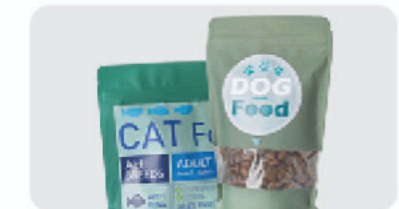
Dry pet food bags