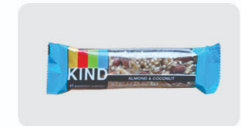
Granola bar wrappers