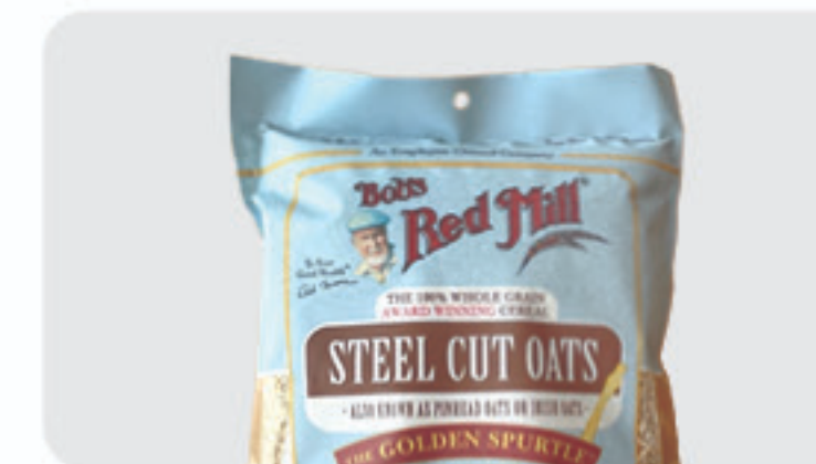
Resealable food bags